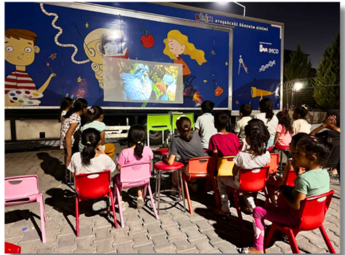
Lotus Women's Solidarity and Life Association, Adıyaman

The association created dedicated "play havens" within shelters, filled with toys, games, and art supplies. These spaces offered a sense of normalcy and joy, helping children cope with the trauma they've faced.