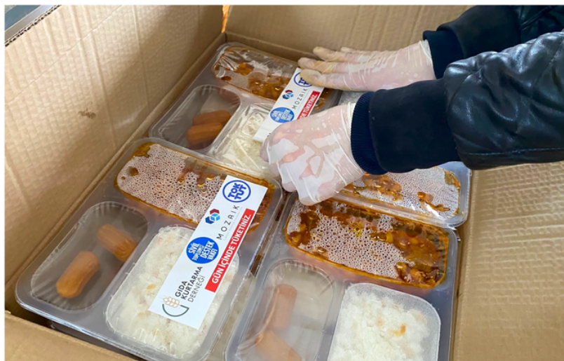
Food Rescue Association, Malatya

Working with TOKTUT, another grantee of our fund, the association delivered 180,000 hot meals to survivors in Malatya, Adıyaman, and Hatay. This quick and strategic response ensured immediate nourishment for those in need, a vital lifeline at a difficult time.