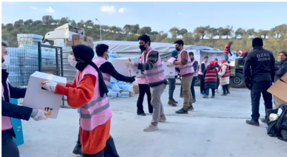
Çorbada Tuzun Olsun Association, Hatay

With their dedication, a daily average of 3,000 individuals, totalling 201,000 people, received food, clean water, clothing, and essential hygiene and medical supplies.