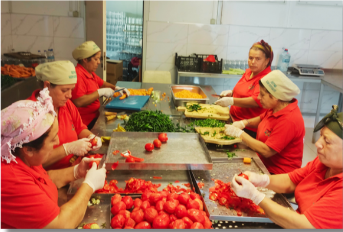
Defne Women's Cooperative, Hatay